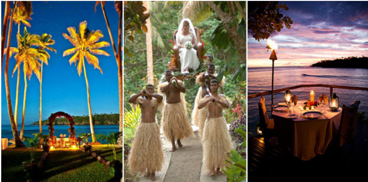
TRADITIONAL FIJIAN WEDDING PACKAGE

“Surrender to the sweet serenity of paradise and escape to the luxuriously, romantic Namale Resort & Spa in the Fiji Islands”